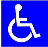
Figure 1. International Symbol of Access (ISO), 1969