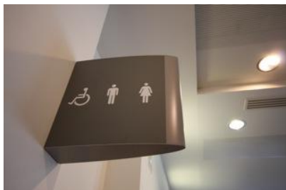
Figure 3. Access Signage (LSE)