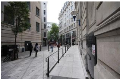
Figure 4. Ramp (LSE)