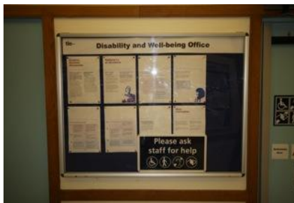
Figure 7. Disability Information Board (LSE)