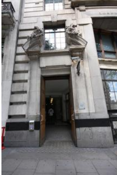
Figure 5. Automatic Doors (LSE)