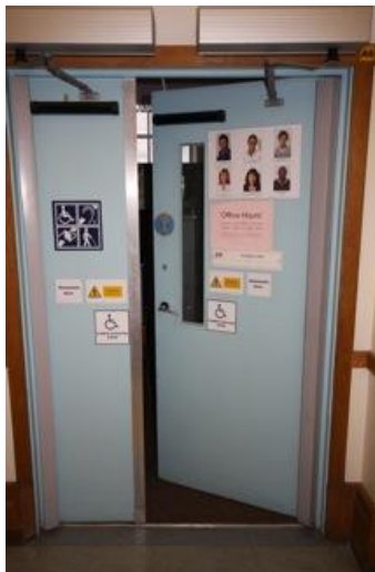
Figure 6. Disability & Well-being Office (LSE)