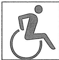
Figure 2. International Symbol of Access (MoMA), 2009